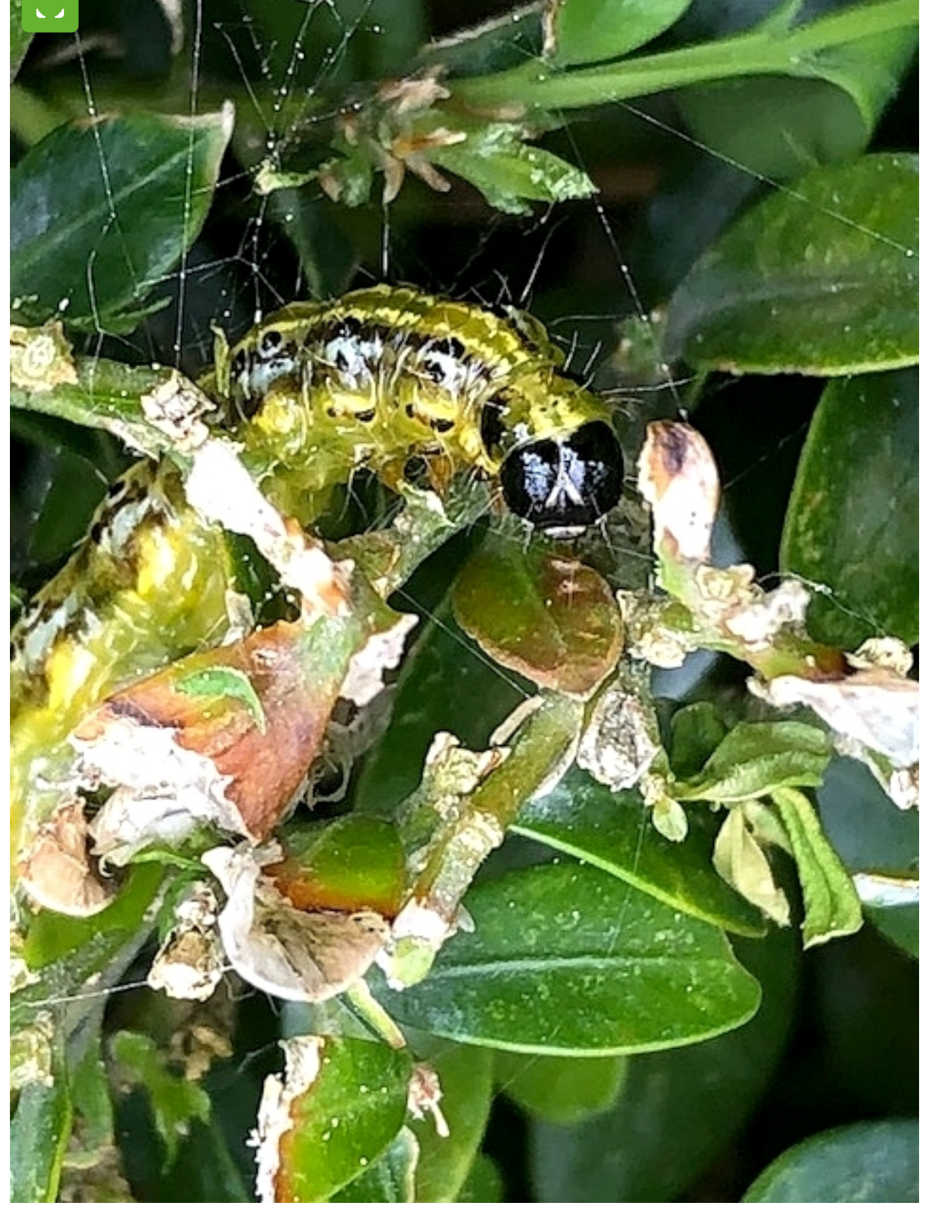
The caterpillars of the box tree moth cause problems for box trees.