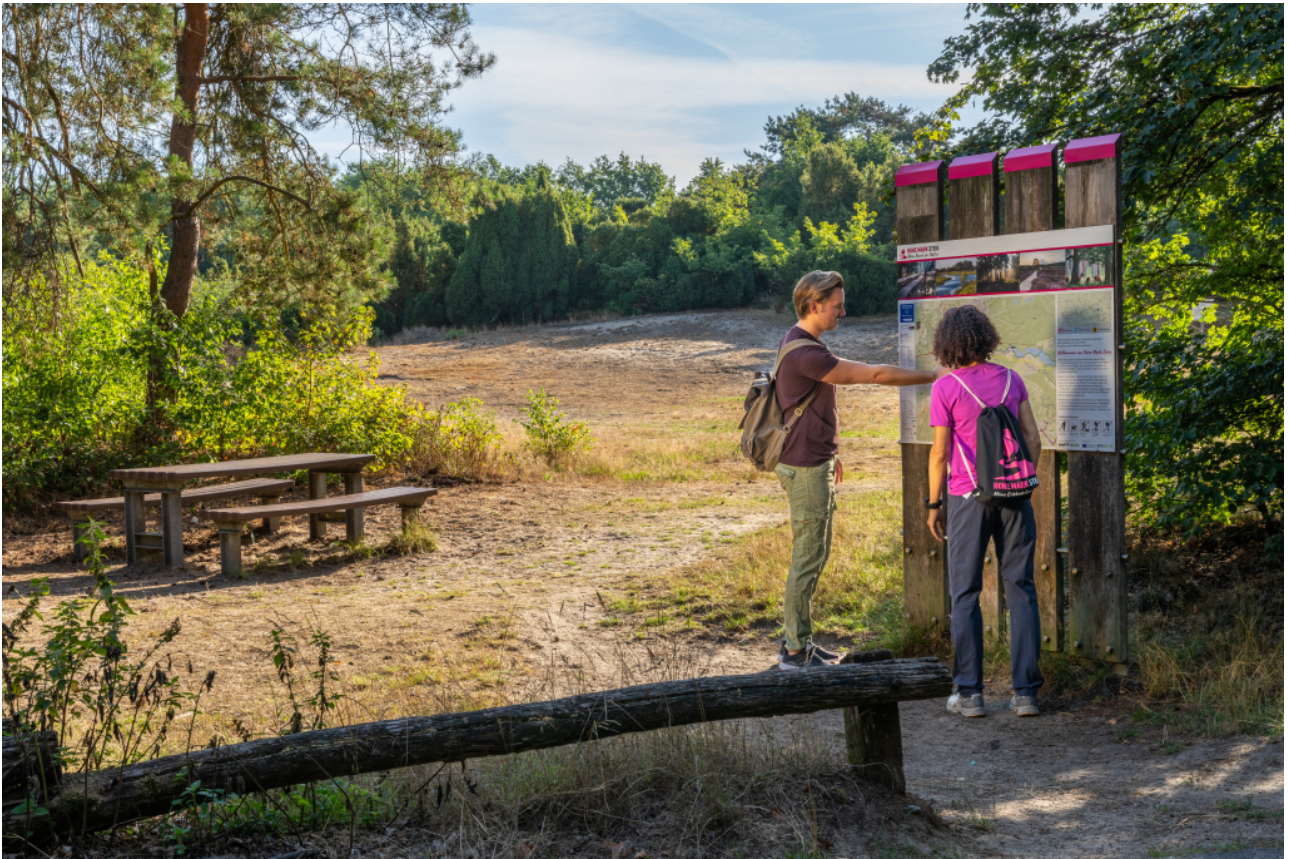
Hohe Mark Steig