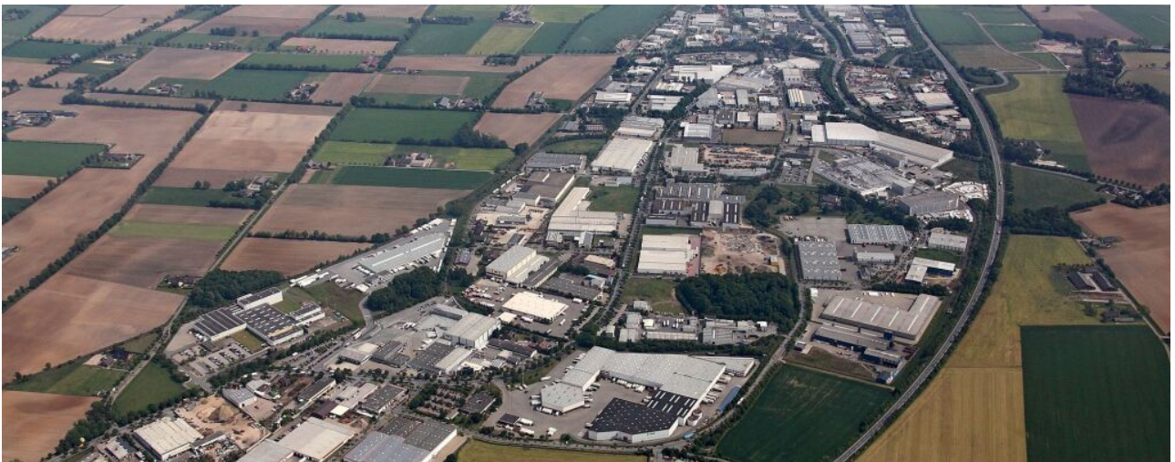
Industrial park ▶