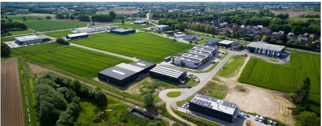
Holtwick Industrial Park ▶