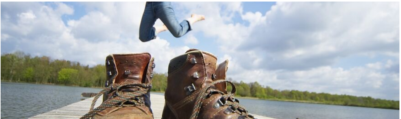
Heavenly hiking and feasting ►