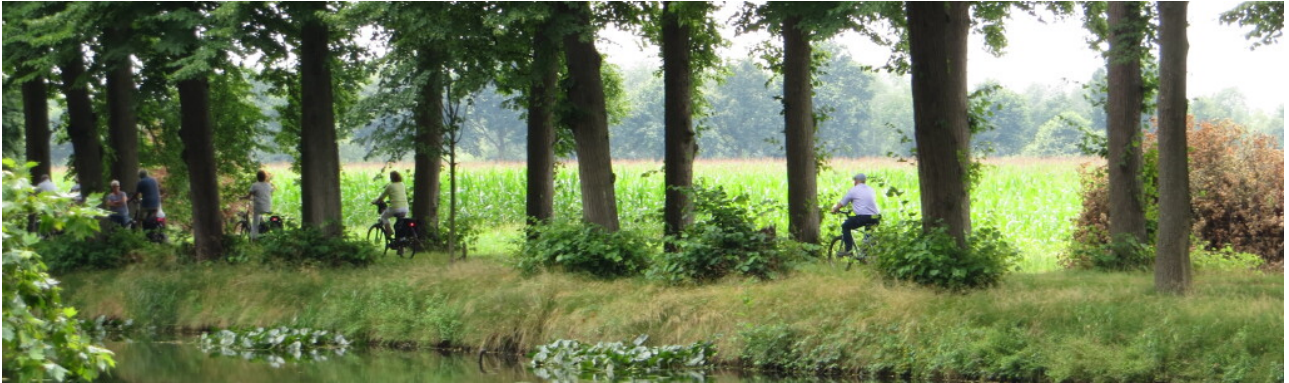
Cycling tour "Eavesdroppers set up" ►