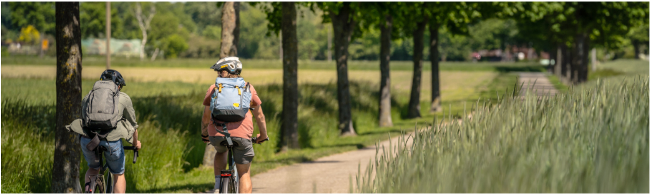
High Mark Route ►