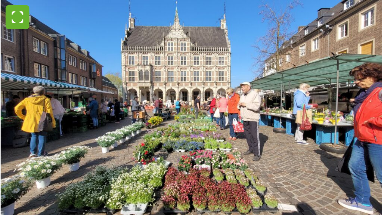
Weekly market in front of Bocholt's historic town hall.

The town of Bocholt is located in the western Münsterland region in the north-west of North Rhine-Westphalia and, with 71,000 inhabitants, is the largest district town in the Borken district.