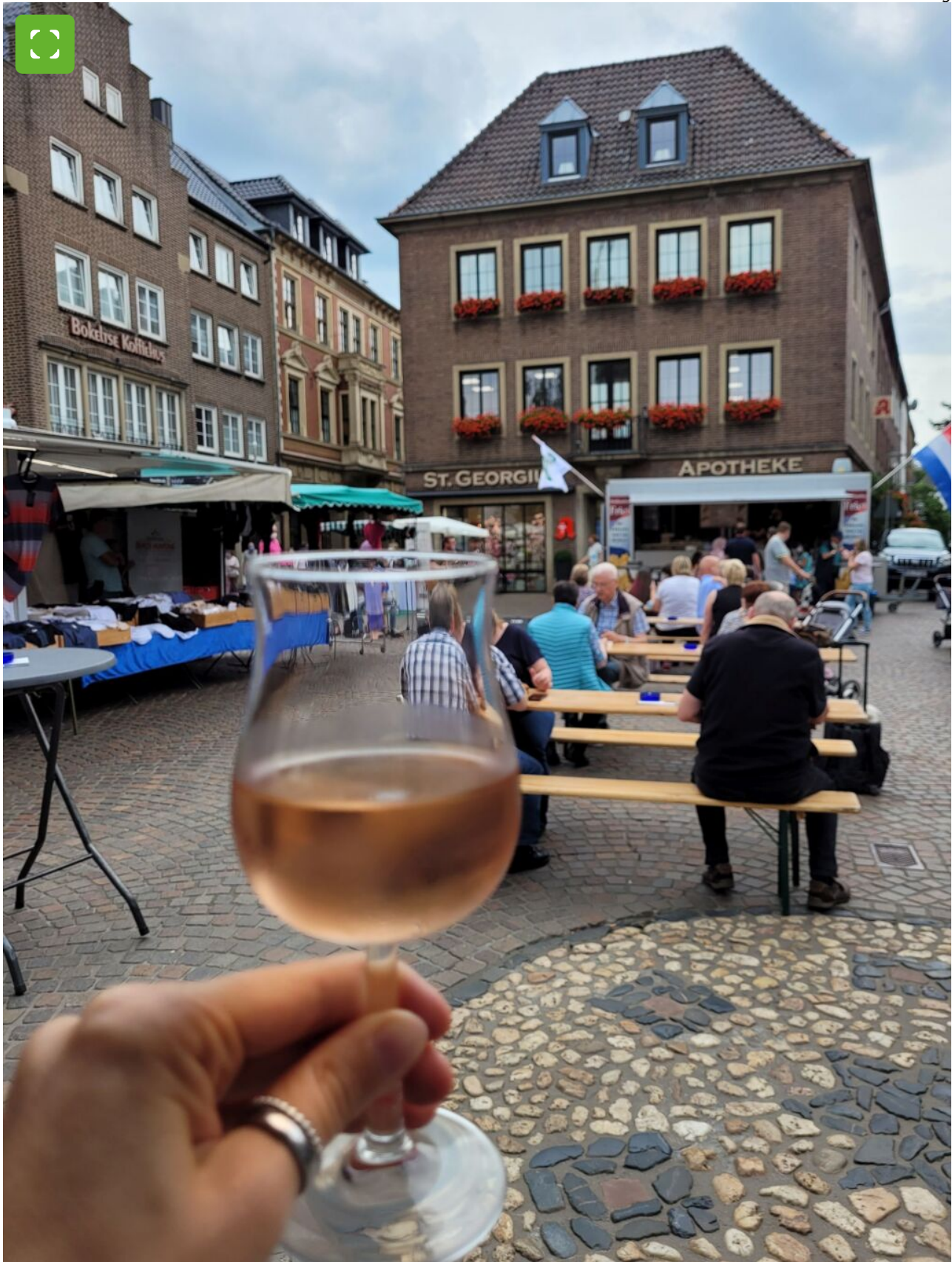
Gourmet break at the evening market in Bocholt.