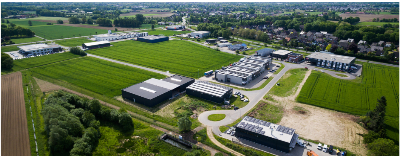
Holtwick Industrial Park ▶