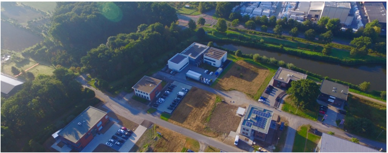
Technology Park ▶