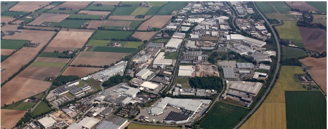
Industrial park ▶